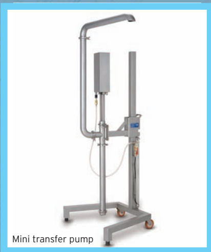
Mini transfer pump